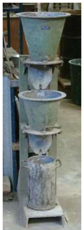
Figure 5.1 – Apparatus Used to Conduct the Compacting Factor Test